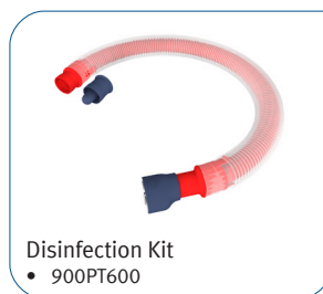
Disinfection Kit • 900PT600