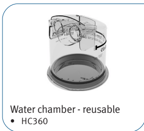
Water chamber - reusable • HC360