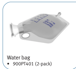
Water bag • 900PT401 (2-pack)