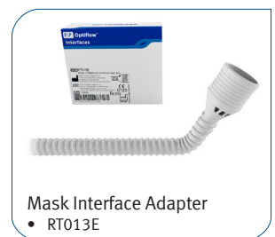
Mask Interface Adapter • RT013E