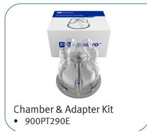
Chamber & Adapter Kit • 900PT290E