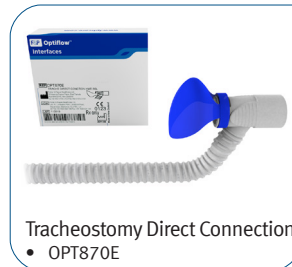
Tracheostomy Direct Connection • OPT870E