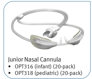
Junior Nasal Cannula • OPT316 (infant) (20-pack) • OPT318 (pediatric) (20-pack)