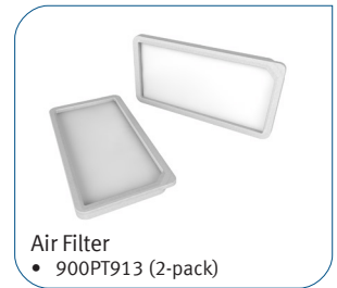
Air Filter • 900PT913 (2-pack)