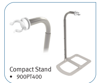
Compact Stand • 900PT400