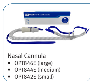
Nasal Cannula • OPT846E (large) • OPT844E (medium) • OPT842E (small)