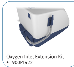
Oxygen Inlet Extension Kit • 900PT422