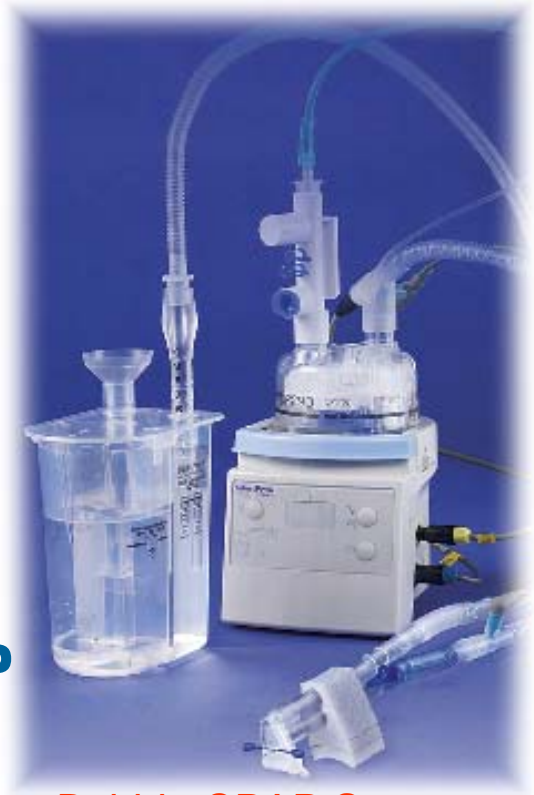
Bubble CPAP System