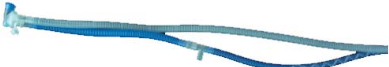
Neonatal Breathing Circuit