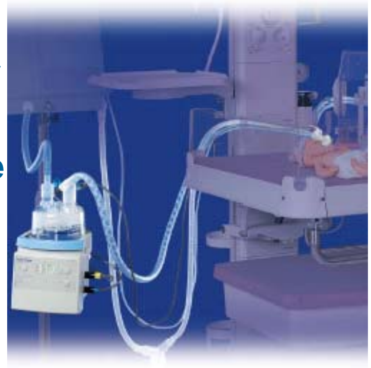
MR850 and Neonatal Breathing Circuits