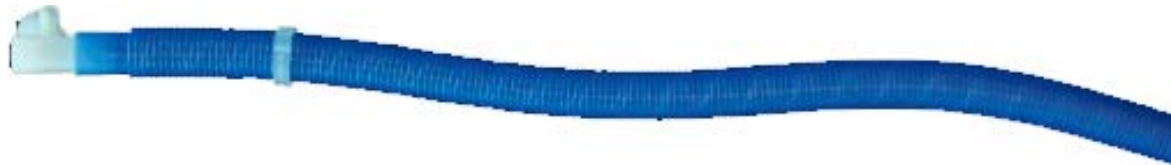
Non-invasive ventilator breathing circuit