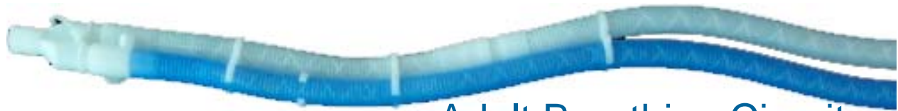
Adult Breathing Circuit