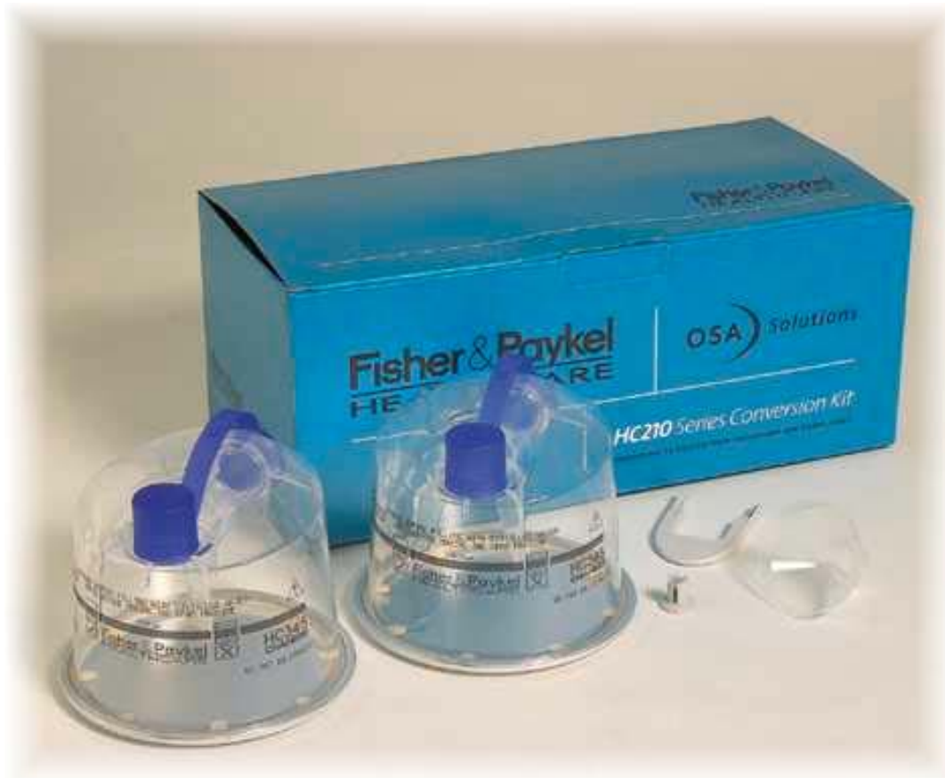
HC210 Series Conversion Kit