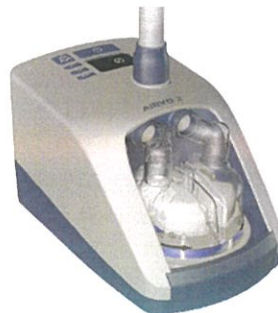
Airvo 2 / myAirvo 2