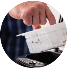
Easy-access water chamber for easy filling