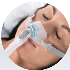
A full range of breathing comfort options