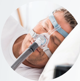
F&P Eson™ 2 A nasal mask that has RollFit™ technology to deliver a precise fit.