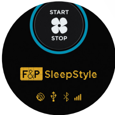
Simple menu allows for easy adjustments to your therapy