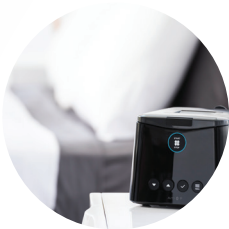
Quiet and compact

The beginning of anything new can be difficult, and it can take time to adjust to it. CPAP therapy is no different. With F&P SleepStyle™ we have worked to understand the daily interactions you will have with your new device, and make these as easy as possible – so you can get set up and started, simply.