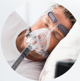
F&P Simplus™ A full face mask that has RollFit™ technology to minimize pressure on the bridge of the nose.