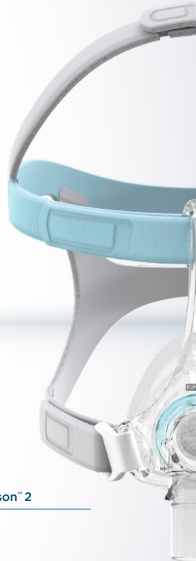
F&P Eson™ 2