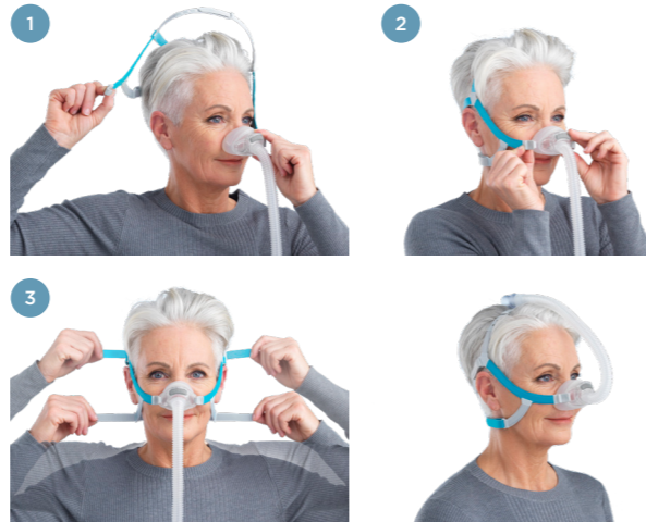
Optional over-the-head connection.

Ask your healthcare provider about F&P Nova Nasal.