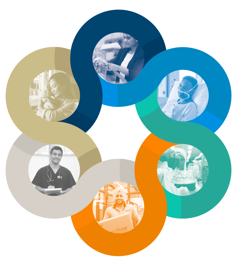
The needs of our customers and their patients drive everything we do. We call this Care by Design .

We work with thousands of healthcare professionals, including doctors, clinicians and nurses, providing them the products and tools to deliver the best possible care. Our products are sold either direct to customers or through distributors. Our largest markets by revenue are North America, Europe and Asia Pacific.