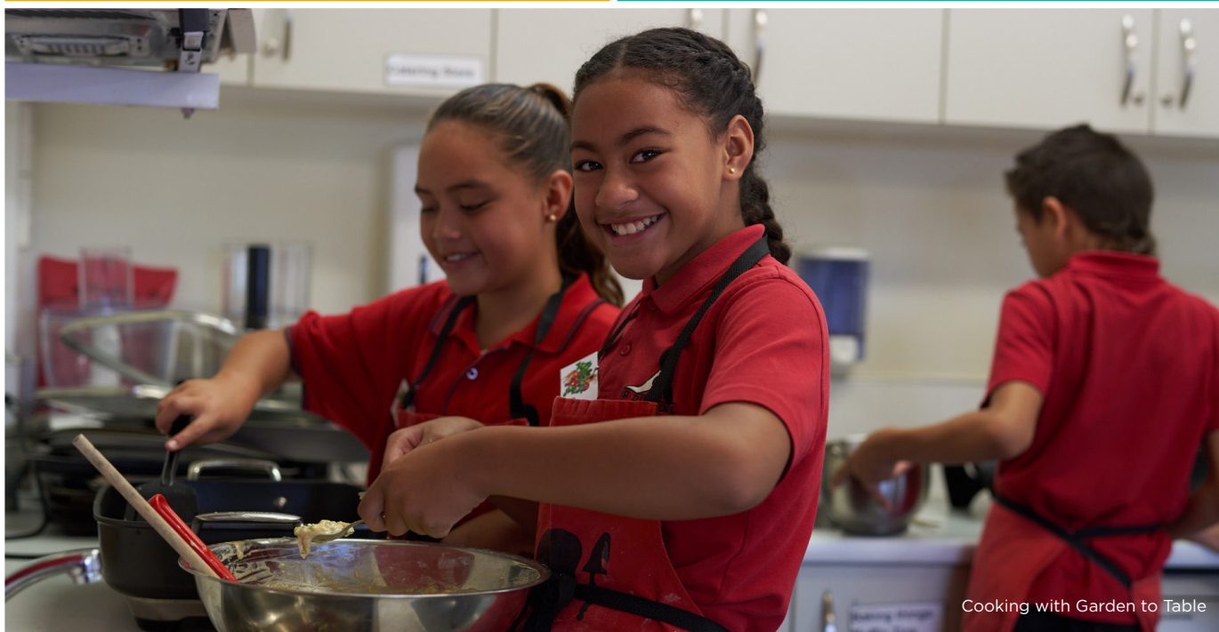
Cooking with Garden to Table

Primary school teacher about Garden to Table