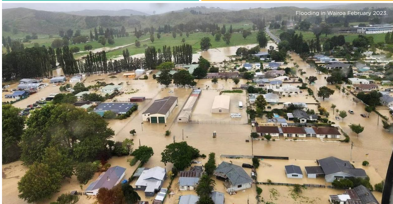
Flooding in Wairoa February 2023.

Created in 1971, Cure Kids is the largest child health research funder in Aotearoa New Zealand with a strong equity focus for tamariki. The Foundation supports Cure Kids' pilot Asthma Project aimed at reducing childhood mortality resulting from severe asthma in Māori and Pasifika children. As the most common childhood chronic illness globally, asthma is a common presentation in the emergency department. This study seeks to understand the percentage of tamariki receiving adequate asthma management, to further understand how to improve education on compliance with treatment.