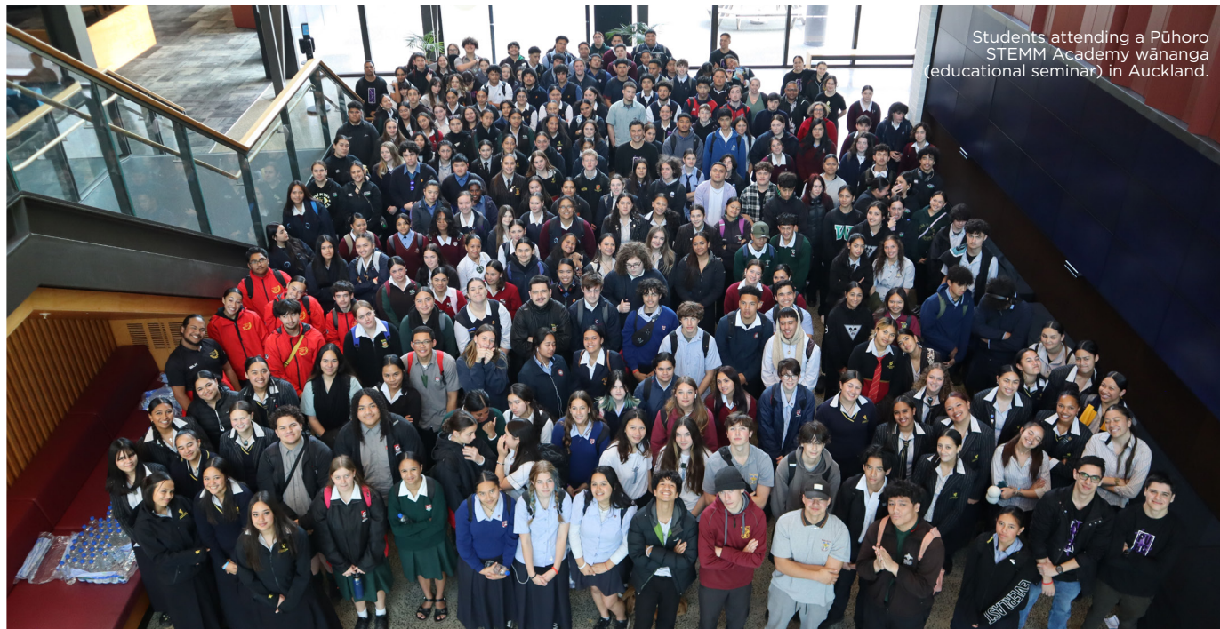
Students attending a Pūhoro STEM Academy wānanga (educational seminar) in Auckland.