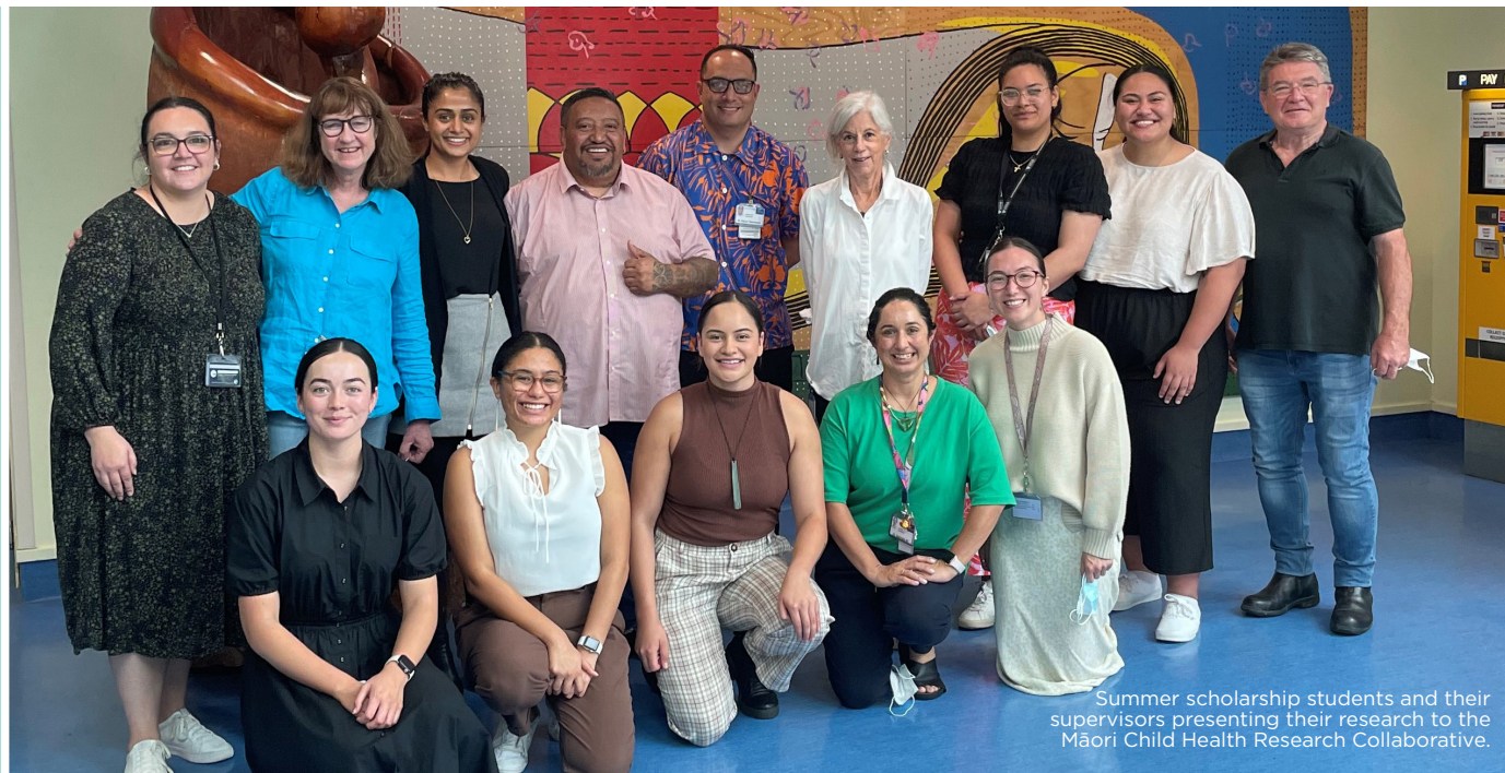
Summer scholarship students and their supervisors presenting their research to the Māori Child Health Research Collaborative.