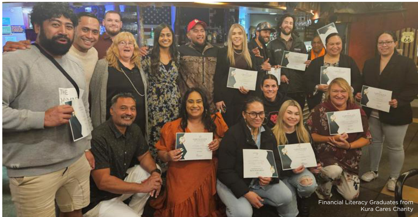
Financial Literacy Graduates from Kura Cares Charity