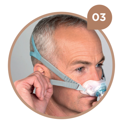
Step 3. Gently tighten or loosen the headgear straps on the sides of the headgear until you achieve a comfortable seal.