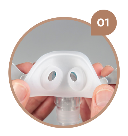
Step 1. Hold the silicone seal away from your nose and use your fingers to carefully spread open the soft side supports of the silicone seal and then guide the two openings into your nostrils.