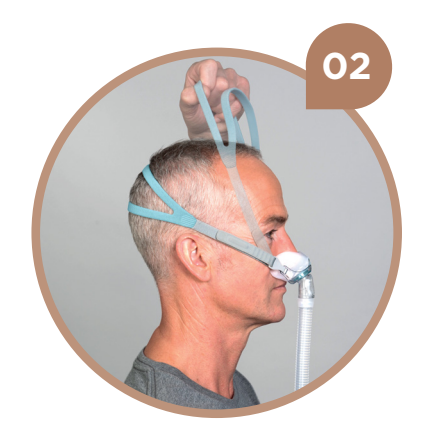
Step 2. Hold the mask frame in position with one hand and pull the headgear over your head with the other hand, positioning the straps above the ears as per the fitting image above.